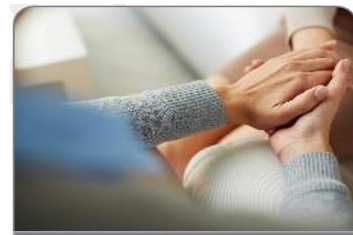
Safeguard people whose mental health makes them vulnerable

The mental health of our residents can be affected greatly by the behaviour of others, particularly where the behaviour goes unchallenged. Whether that is the behaviour of inconsiderate neighbours or a coercive and/or controlling partner, the impact can have a significant impact on an individual's quality of life. Mental Health concerns can lead to people targeting their vulnerability and abusing them for financial or other forms of gain. People with mental health concerns can also be the cause of anti-social behaviour themselves, which affects others or a wider community. They can also become isolated, lose their support network and neglect their own care.